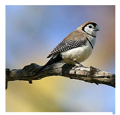
Geoffrey Dabb (COG)

The Double-barred Finch is notable for its white face bordered by black, black and white spotted wings and distinct black band across its chest. They usually feed in flocks and have a bouncing, undulating flight pattern. You often hear them before seeing them as their call is a low, drawn out "tzeeaat, tzeeaat".