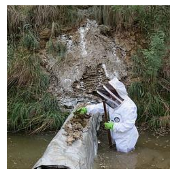
Nest being removed near Kambah

Please keep an eye out for any wasp activity and contact the European Wasp Hotline on 6162 1914 if you suspect you have discovered a nest.